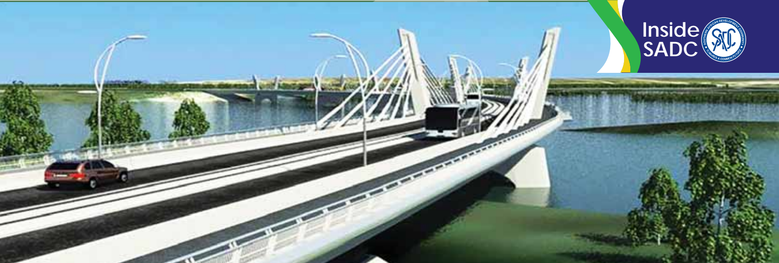
Artistic impression of the Kazungula Bridge