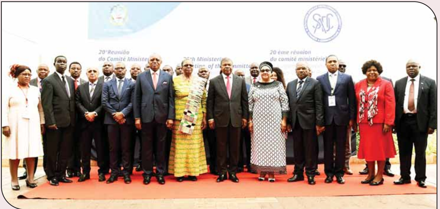
H.E João Manuel G. Lourenço, President of Angola and Chairperson of the SADC Organ on Politics, Defence and Security Cooperation (centre), SADC Executive Secretary, H.E Dr Stergomena Lawrence Tax (5th from right) and other dignitaries during the official opening of the 20th Ministerial Committee of the Organ (MCO) meeting in Luanda, Angola Story on page 3 & 4

3 RD ANNUAL SADC INDUSTRIALISATION WEEK PROMOTING INFRASTRUCTURE AND YOUTH EMPOWERMENT FOR SUSTAINABLE DEVELOPMENT