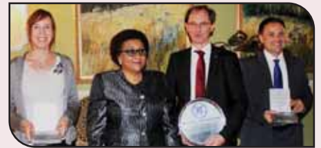
SADC SECRETARIAT BIDS FAREWELL TO EU HEAD OF DELEGATION PAGE 16