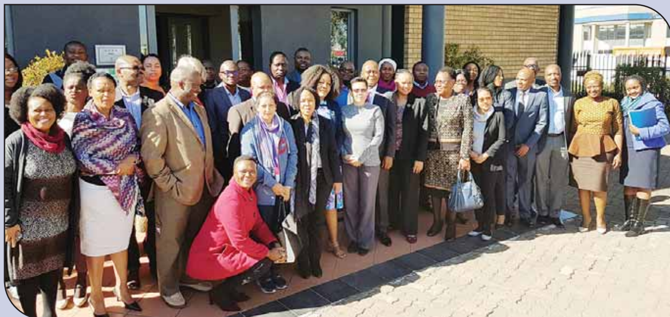
Food and Nutrition Security Steering Committee members