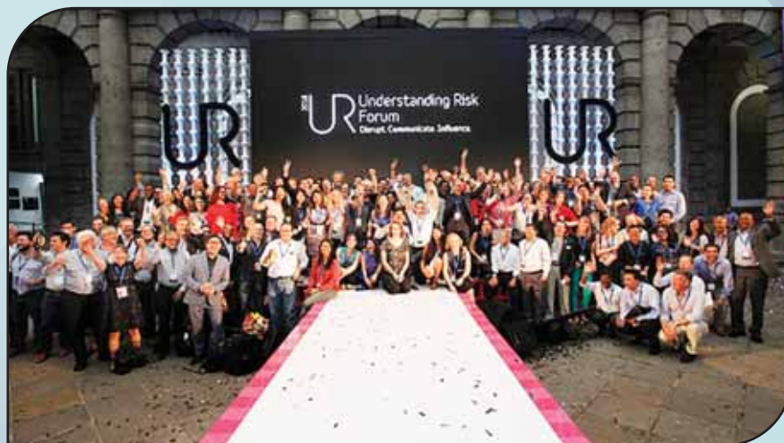
Group photo of delegates