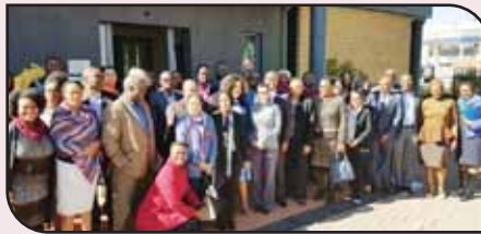
FOOD AND NUTRITION SECURITY STEERING COMMITTEE LAUNCHED PAGE 5