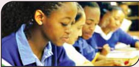
SADC SAYS YOUTH EMPOWERMENT IS IMPERATIVE FOR INDUSTRIALIZATION PAGE 15