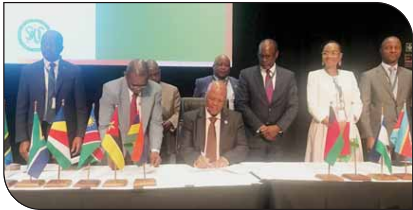
Ministers signing a statement of intent on cooperation on development of regional gas market and infrastructure

characterised by high levels of unemployment especially among the youth. He further urged SADC Member States to intensify efforts to stimulate national energy efficiency planning and to provide strong technical support across the value chain, especially in rolling out various energy efficiency programmes.