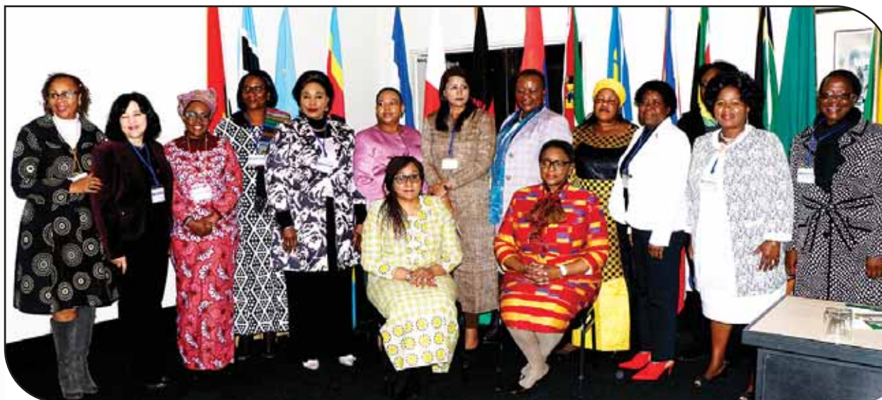
Honourable Dlamini (seated right), H.E. Dr Tax (seated left) flanked by SADC Ministers for Gender and Women Affairs

The Southern African Development Community (SADC) Ministers responsible for Gender and Women's Affairs have been called upon to step up their efforts towards achieving gender equality and women empowerment in the region.