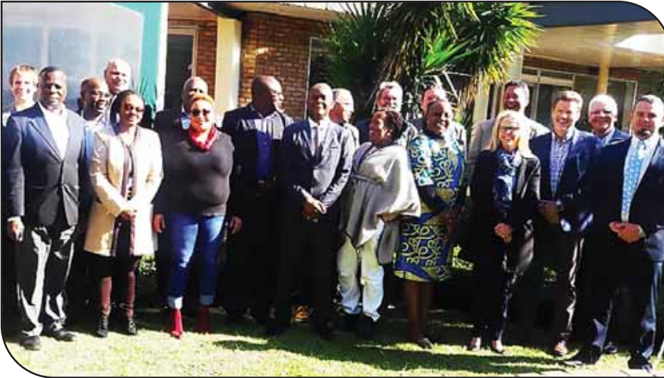
Group photo of delegates