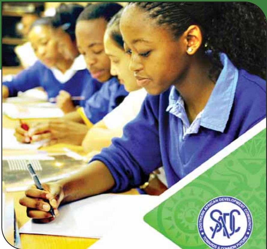
Youth have potential to spur economic growth